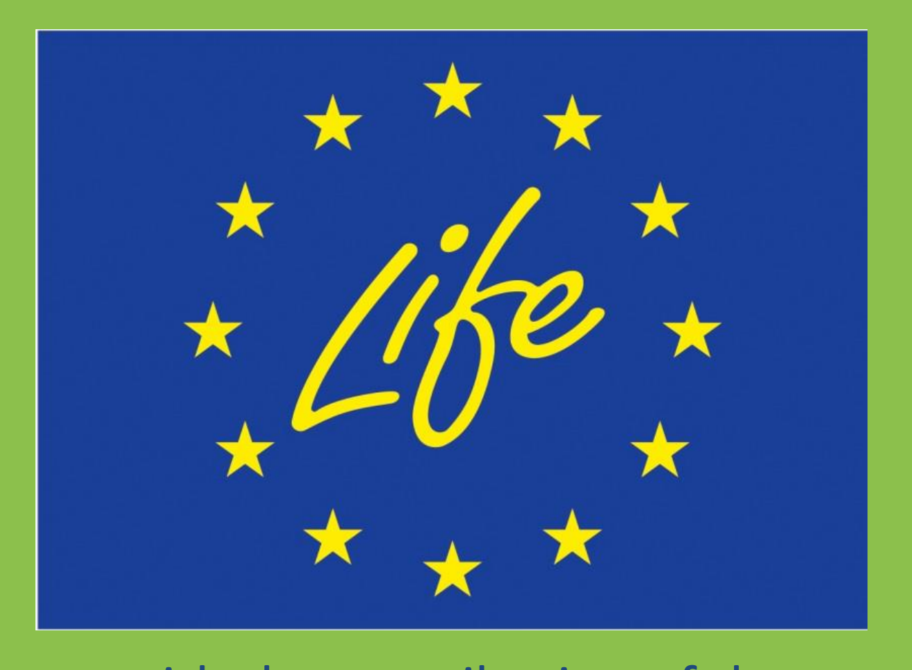
with the contribution of the LIFE Programme of the European Union